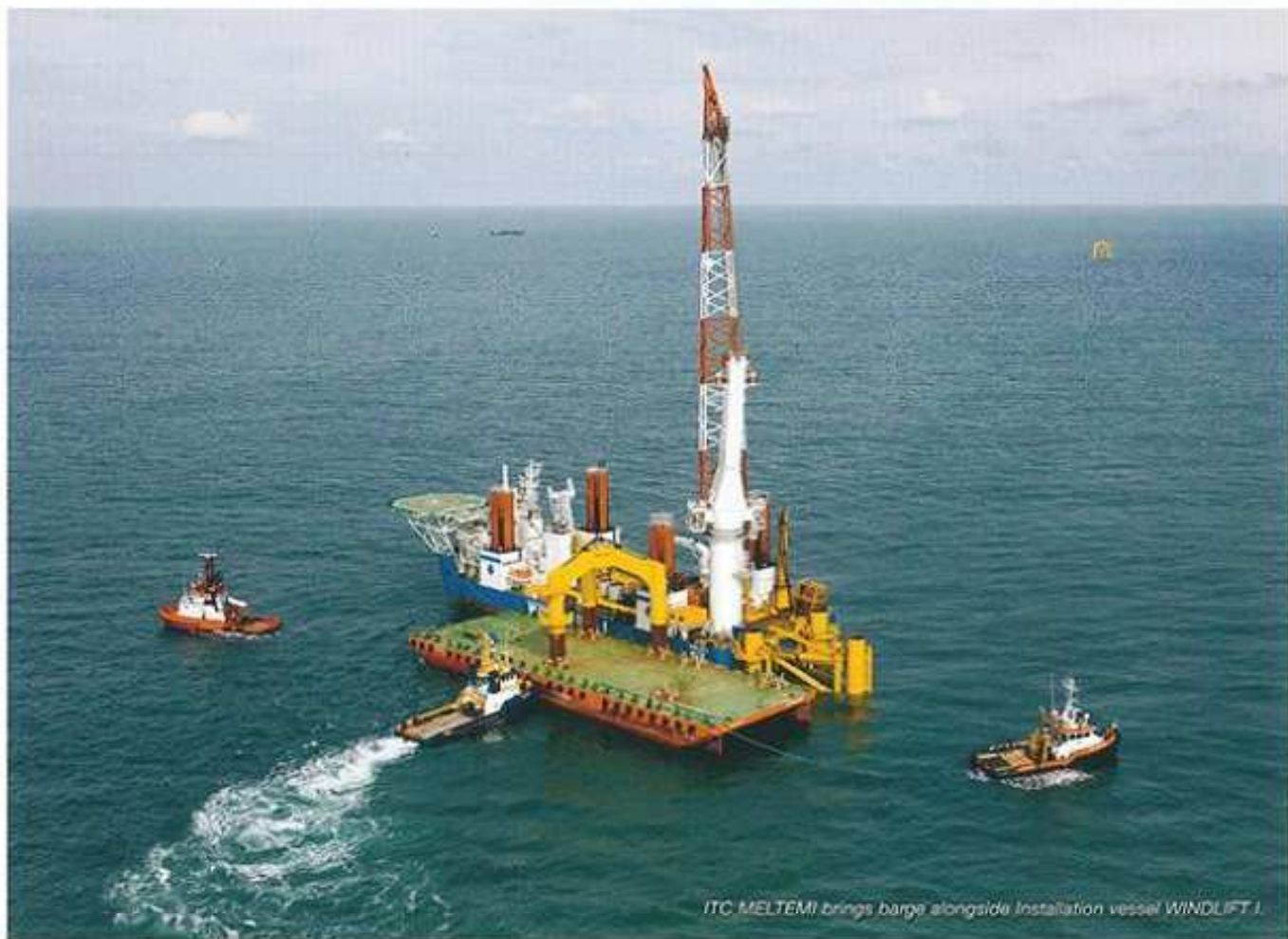
ITC MELTEMI brings barge alongside installation vessel WINDLIFT 1