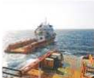
SUPPORT ACTIVITIES IN SANTOS BASIN