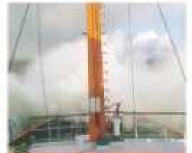
FAREWELL TO THE S-WIND CLASS TUGS